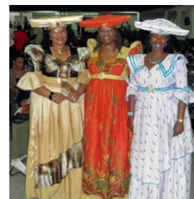
Nambian traditional dress

journey heavenward in order to clearly see the work ahead of us on earth. ACU is being raised up by Christ working through these Zambian churches at a critical time as materialism and secularism are coming like a tsunami upon this continent. The need for the churches to continue to provide avenues for discipleship to prepare the next generation to carry the torch onward is palpable. At the conference was shared ACU's vision to fill this need and equip young men and women to go out as ambassadors for Christ through every vocation, to every part of Africa and beyond in response to this beckoning call. May the Lord of the harvest see fit to bring this work of ACU to fruition for His glorious name's sake.